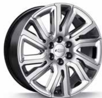
22x9-Inch Aluminum 6-Split-Spoke Wheel in Midnight Silver with Chrome Inserts