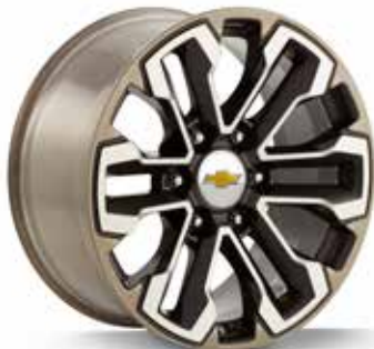
18x8.5-Inch Aluminum Wheel in Satin Graphite with Gold Oxide