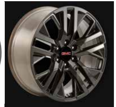
22x9-Inch Aluminum 5-Split-Spoke Wheel in High Gloss Black