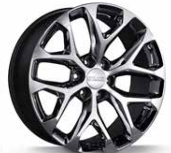
22x9-Inch Aluminum Multi-Spoke Wheel in Chrome