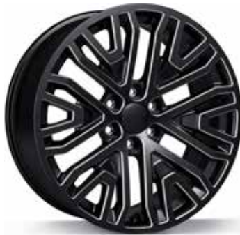
22x9-Inch Aluminum 6-Split-Spoke Wheel in Low Gloss Black with Machined Accents