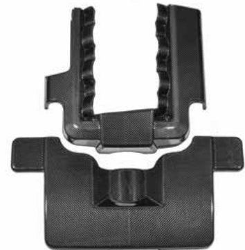
Carbon Fiber Intake and Plenum Cover Set