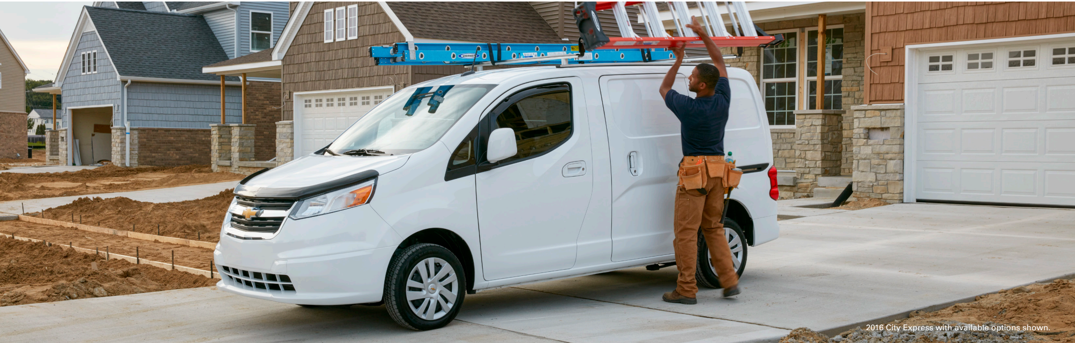
2016 City Express with available options shown.